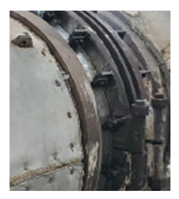
Expansion Joint Repair