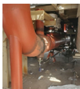
Main Steam Header Replacement