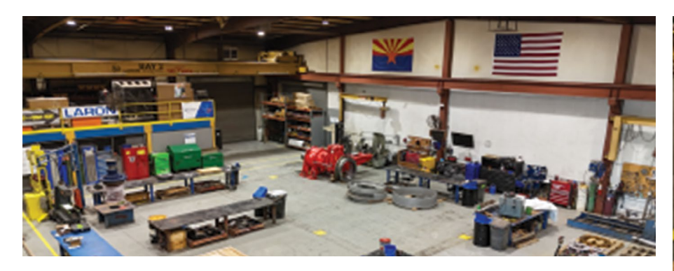
165,000 Square Foot Facility